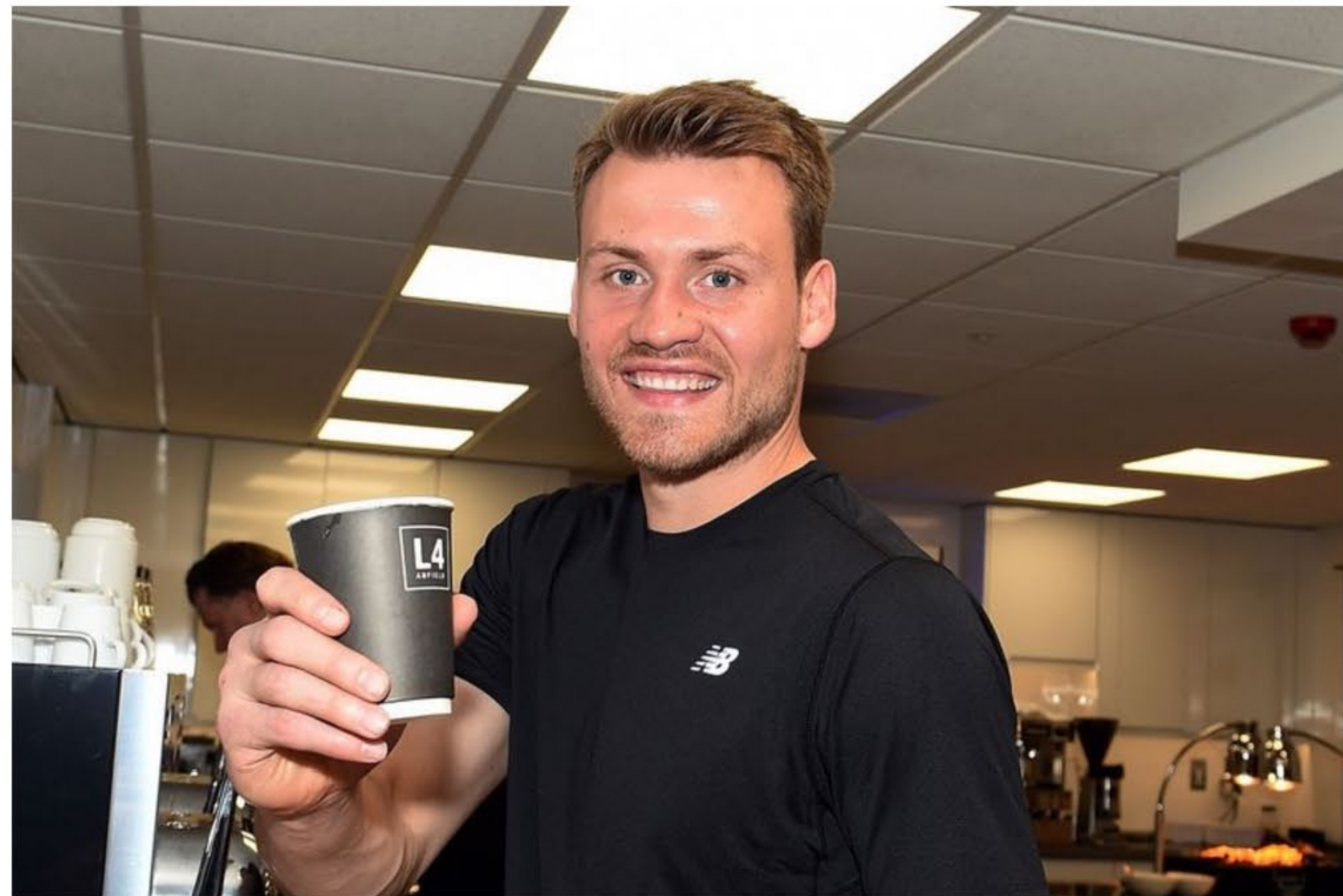
Simon Mignolet of Liverpool at Melwood

962 SHARES 4 COMMENTS BY PAUL GORST 15:40, 14 JUN 2017 UPDATED 12:14, 15 JUN 2017